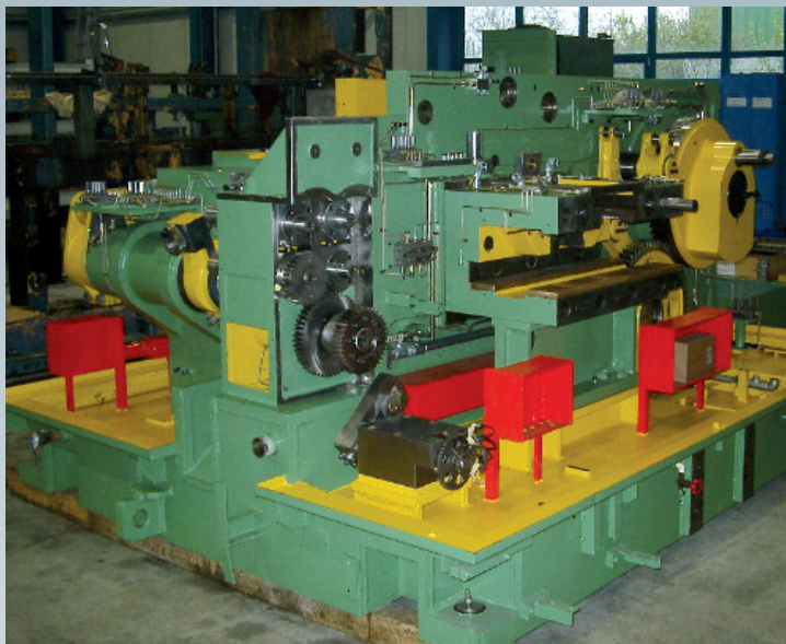
During the rebuilding

Is your work to do with machinery for fasteners or cold and hot forming presses? Then it is good that you have found us!