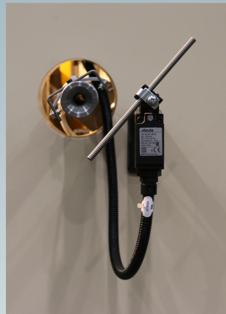
Bar/Wire End Control System

We are there for you – worldwide and around the clock!