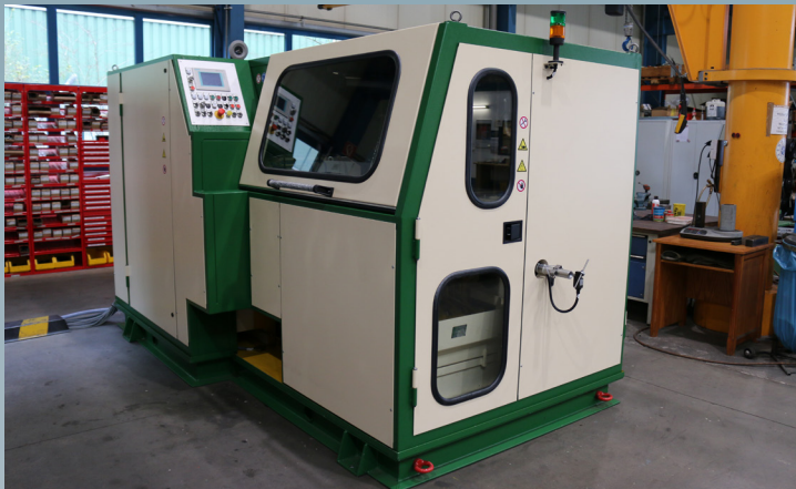
Sound Enclosure with Integrated Oil Pan

Besides of the mechanical general rebuilding, this machine was equipped with an oil pan and a sound enclosure. Furthermore, by means of new control system we had the chance to realize a bar/wire end control system which makes it possible to use bar ends as well as wire ends from coil for production. Now, after modification, this machine fulfills again all demands to a modern technique, to the sound protection and the occupational health and safety.